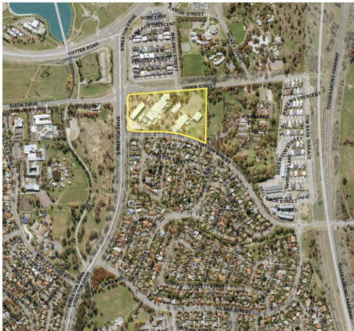
SUBJECT SITE AND SURROUNDS

HAVE YOUR SAY AND HELP INFORM THE DEVELOPMENT APPLICATION FOR THIS EXCITING PROJECT